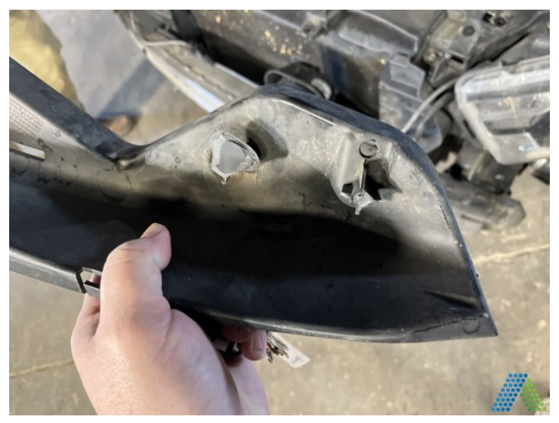
Document Name: Photo 05.jpg Remarks: