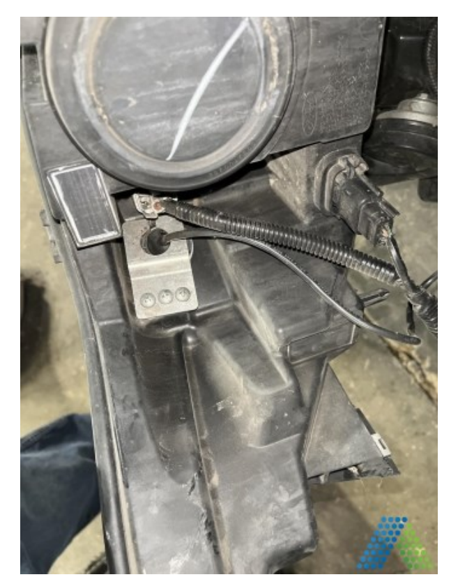
Document Name: Photo 10.jpg Remarks: