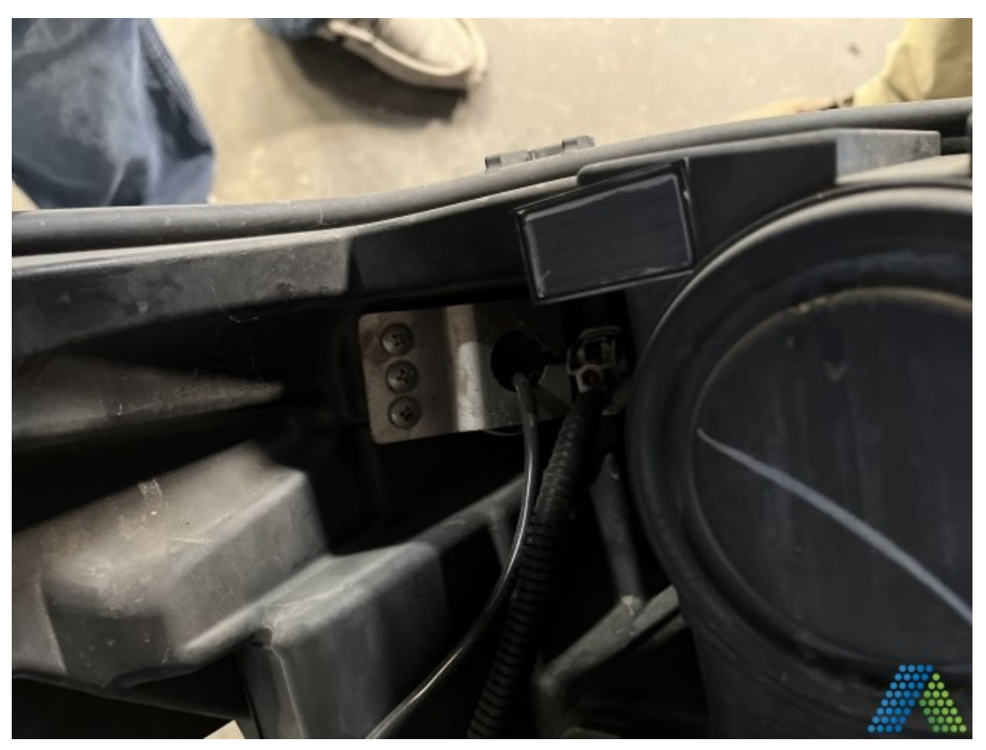
Document Name: Photo 09.jpg Remarks: