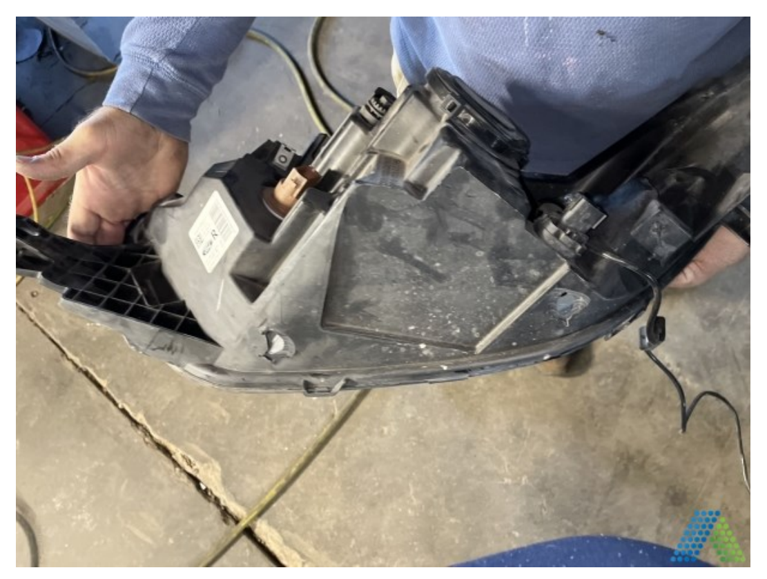
Document Name: Photo 11.jpg Remarks: